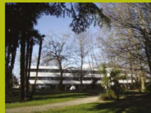
ISA-BTP - Anglet